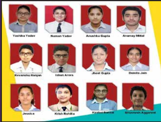
12 students of Class X cleared the prestigious Mukhyamantri Vigyaan Pratibha Pariksha (MVPP).