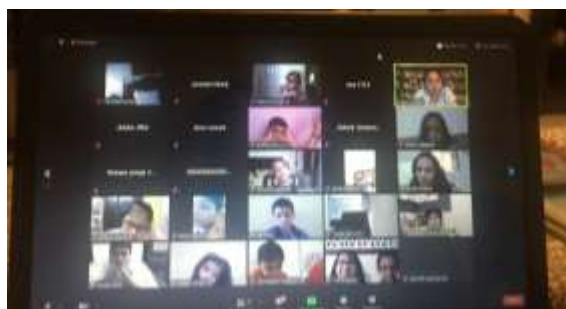
Story Telling - Theme "Dark-Less"