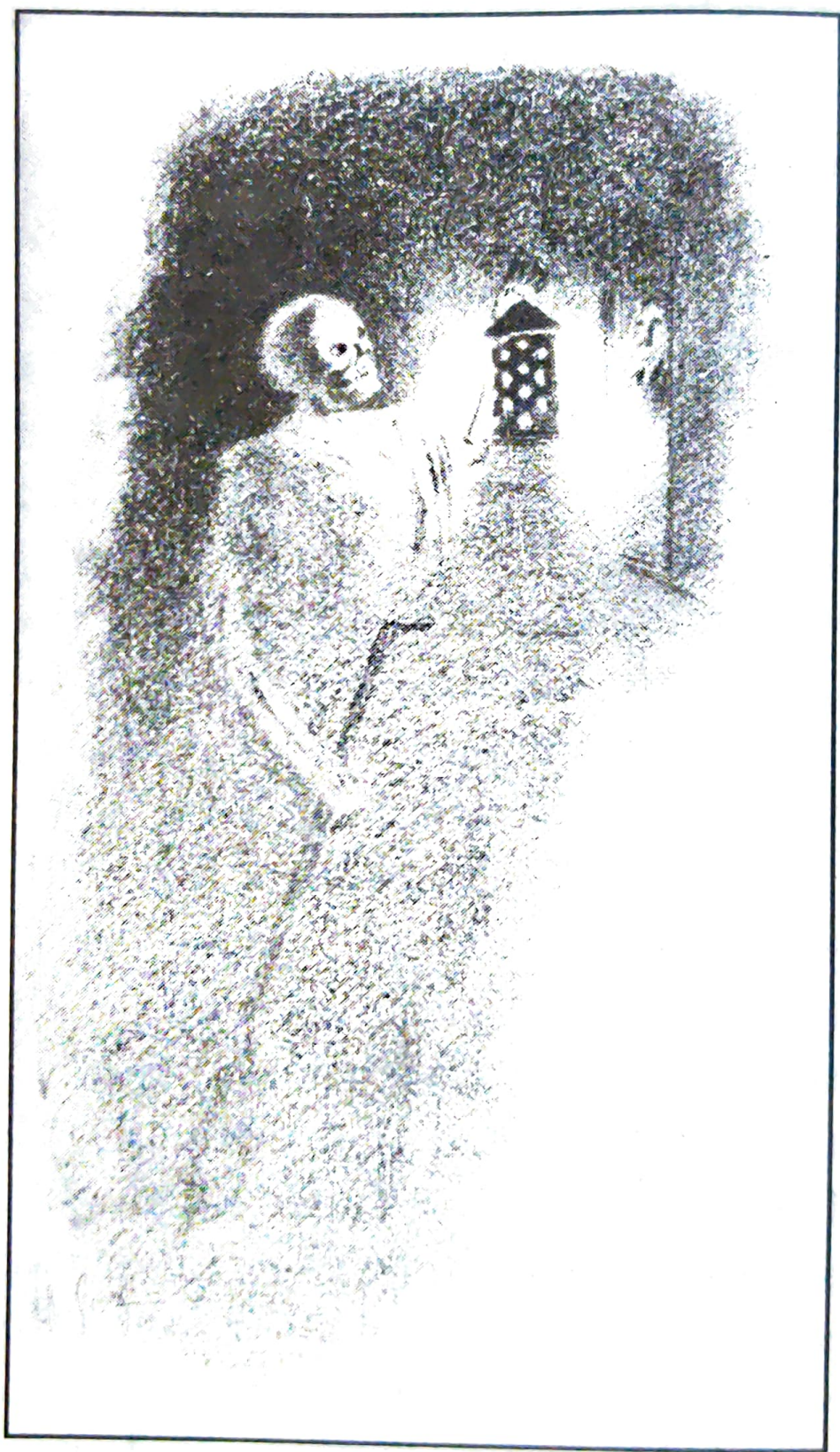
"MAKING SATIRICAL REMARKS ON THE PHOTOGRAPHS"