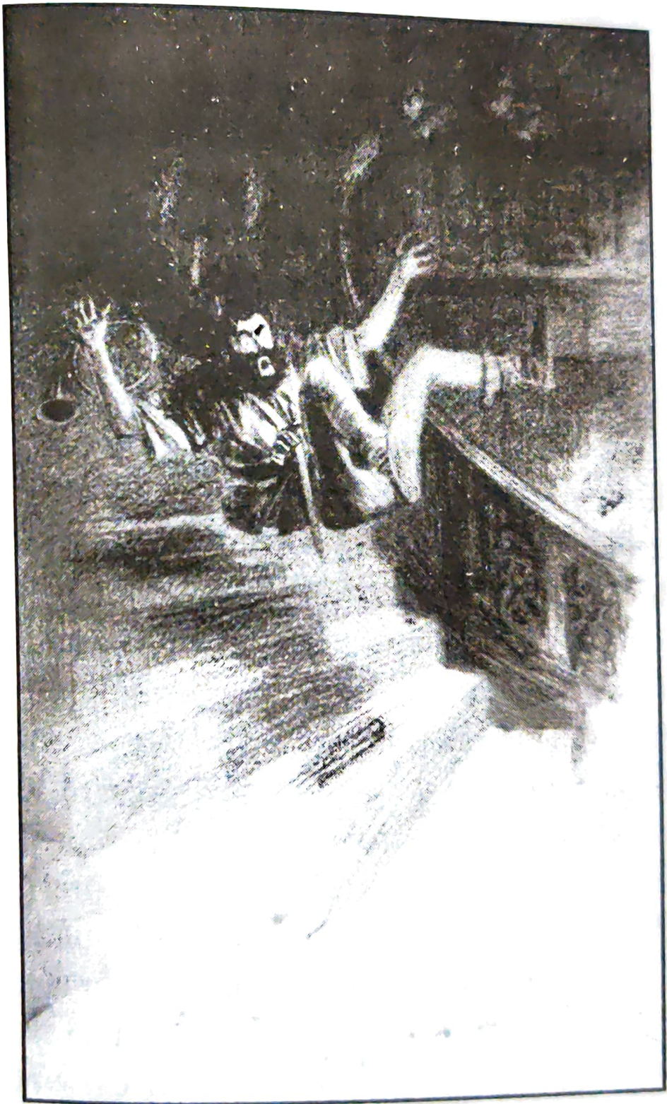
"HE MET WITH A SEVERE FALL"