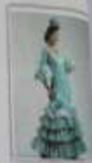
6 Spain Trajes Flamenco