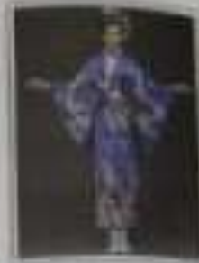
2 Japan Kimono