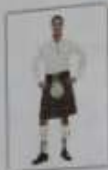
4 Scotland Kilt