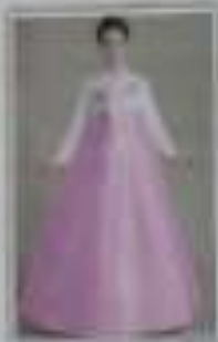
3 Korea Hanbok