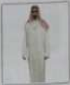
1 Saudi Arabia Thoub

We can identify people of different countries from the dresses they wear. Here are some dresses you should know about.