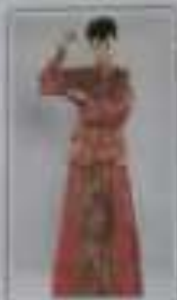
5 China Cheongsam

Burmese men and women wear longis, which is just a colourful wrap-around lungi as worn in India.