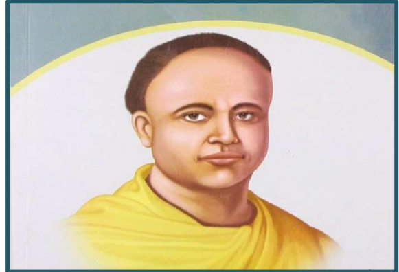
Ishwar Chandra Vidyasagar