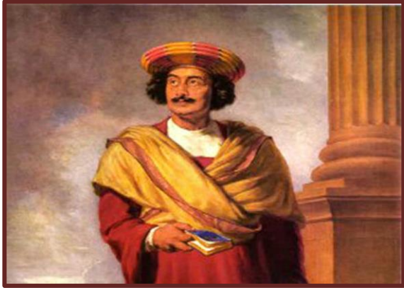
Raja Rammohan Roy

The British introduced modern education in India. Gradually, educated Indians introduced many social and religious reforms, i.e. trying to improve the situation of the country by removing the faults.