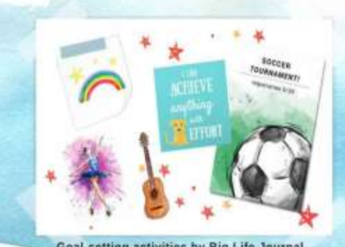
Goal-setting activities by Big Life Journal biglifejournal.com