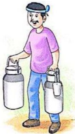
I bring milk.