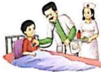
A doctor treats people who are sick or hurt.