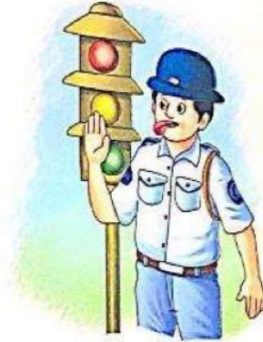
I manage traffic on the road.