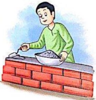
I help in building a house.