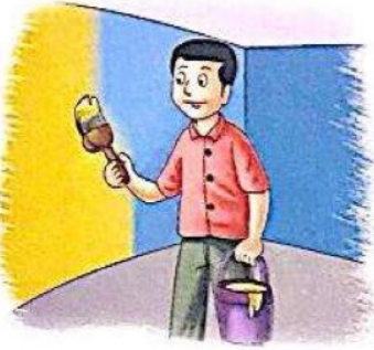
I paint the house.

Given below are some more helpers. Write their names. Use the words given in the boxes.