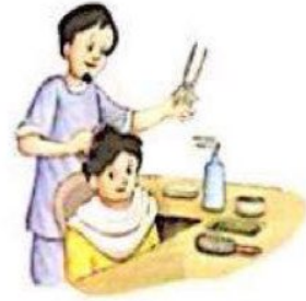
A barber cuts hair.