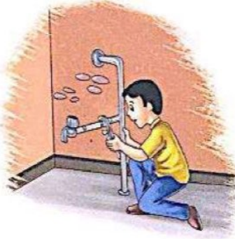
I repair taps.