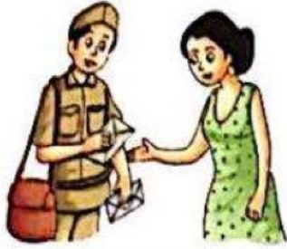
A postman brings letters and parcels.