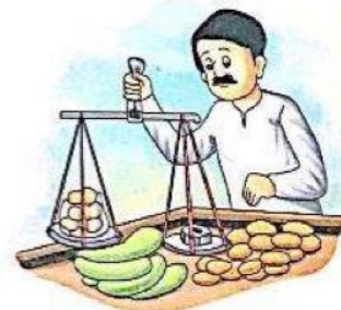
I sell fruit and vegetables.