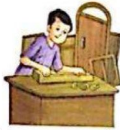
A carpenter makes furniture.