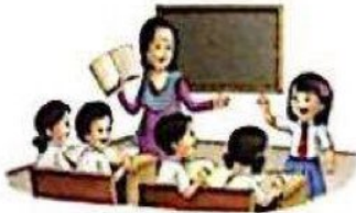
A teacher teaches in a school.