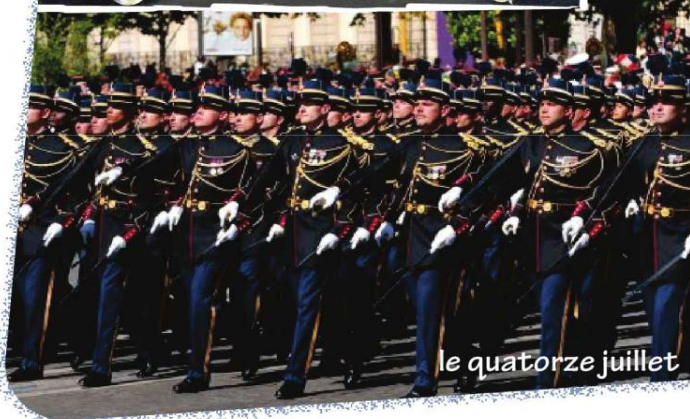
le quatorze juillet