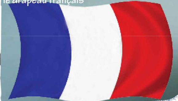
le drapeau français

Euro ( l'euro ) is the currency of France. The French flag ( le drapeau français ) is tricolour ( blue, white and red ) and July 14th ( le quatorze juillet ) is the Republic Day of France.