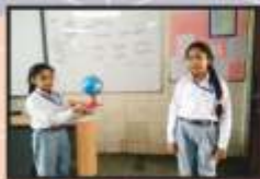
Students of class IV learnt about equinox

Students of the Senior Astronomy Club conducted Project Paridhi Antumnal Equinox. 25 students participated in this event. 'Project Paridhi' is a science experimentation project by SPACE to popularize hands on science. A Power Point Presentation about this project was given by Mrigank of class X, and the activity was demonstrated by Aviral of class X who also answered a lot of questions during the presentation. After the presentation students were divided into groups to start the activity by marking shadows. Students marked the shadow in intervals of 2 minutes. After the marking, they calculated the circumference using the shortest shadow and distance.