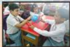
Students of class III learnt about finding NP and SP