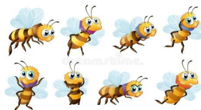
A HIVE OF BEES