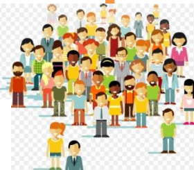
A CROWD OF PEOPLE