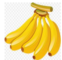
A COMB OF BANANAS