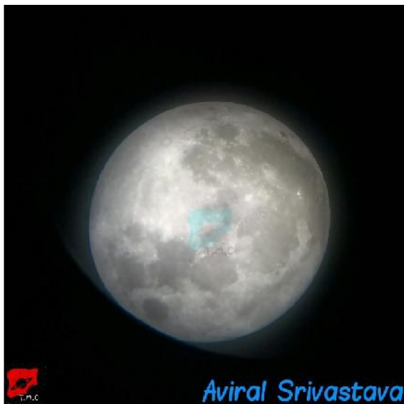
Picture of Supermoon

Well, all the credit goes to elliptical orbit of the moon, remember this causes Luna (The moon) to change its distance from us! So when Luna is at the nearest position to Earth i.e. Perigee (that of Full Moon) we call it a Supermoon. Here is a picture of Supermoon clicked by me using a telescope.