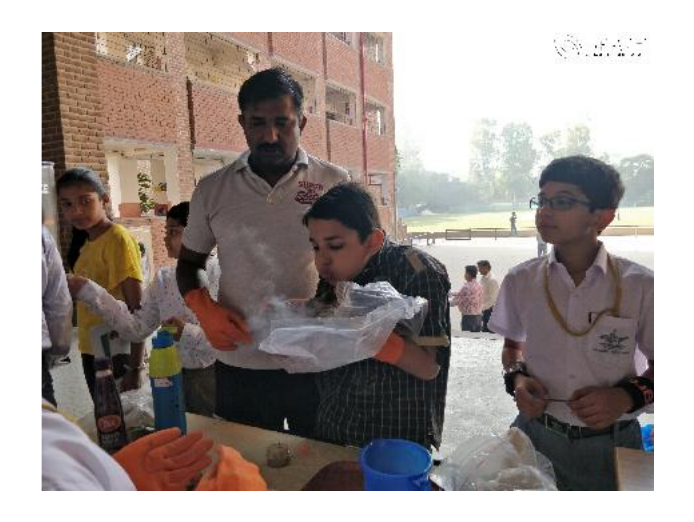
Students and Parents enjoyed making Comets