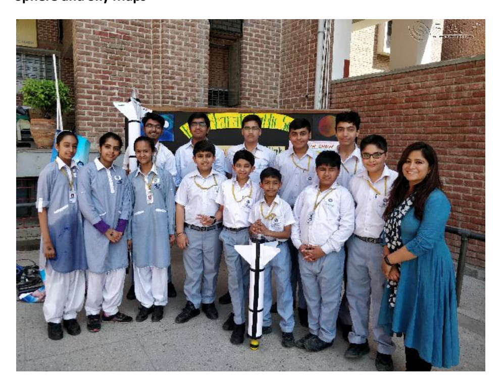
Group photograph of student's volunteers

FEEDBACK : Everyone enjoyed the showcase and appreciated students for their hard work.