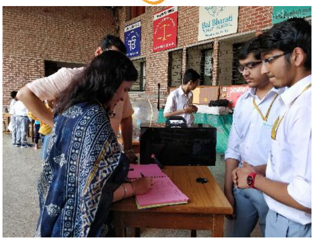
Parents gave feedback of the event