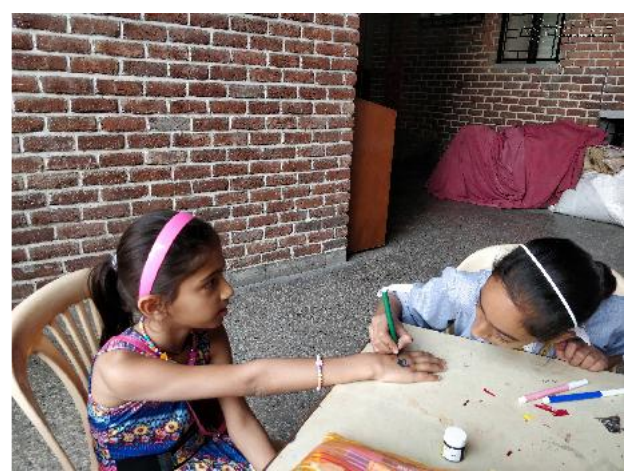
Students got themselves and Astro-tattoo