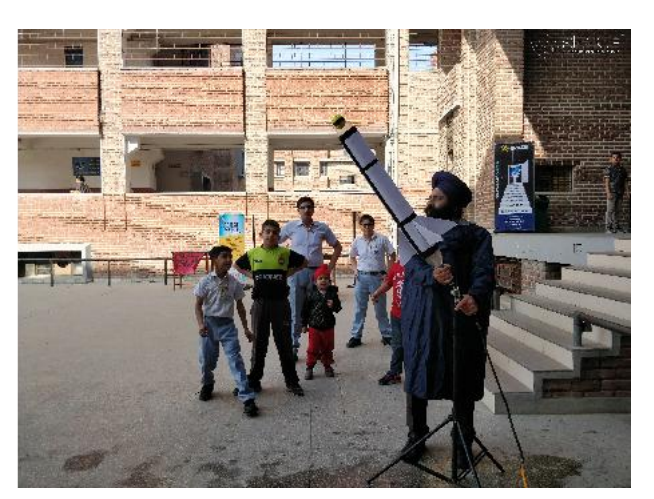
Parents enthusiastically participated in the Hydro-Rocket launching