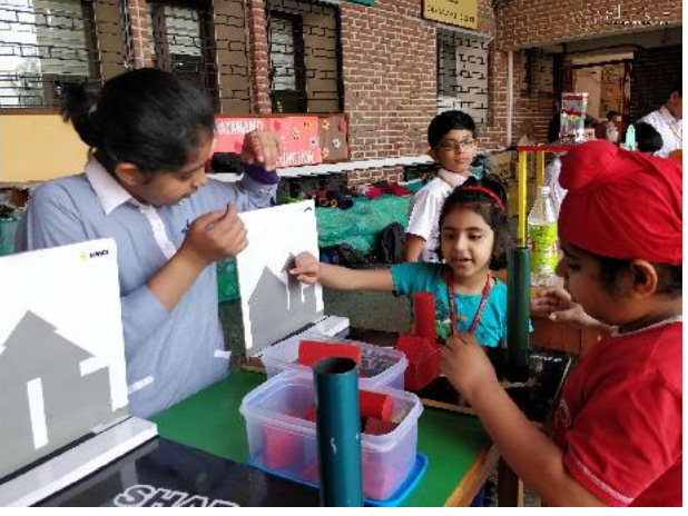
Students enjoyed the shadow show game